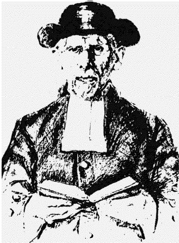
נעים זמירות ישראל